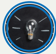
Learn New Skills