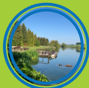
360 Acres of Beautiful Land