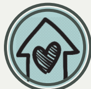
Accommodation *subject to availability*