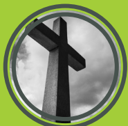
Culture of Prayer & Worship